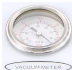
The indicator of vacuum pressure