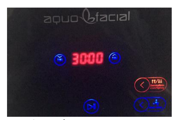
Dermabrasion/ Spray Running State

1. Press button to open the spray function.