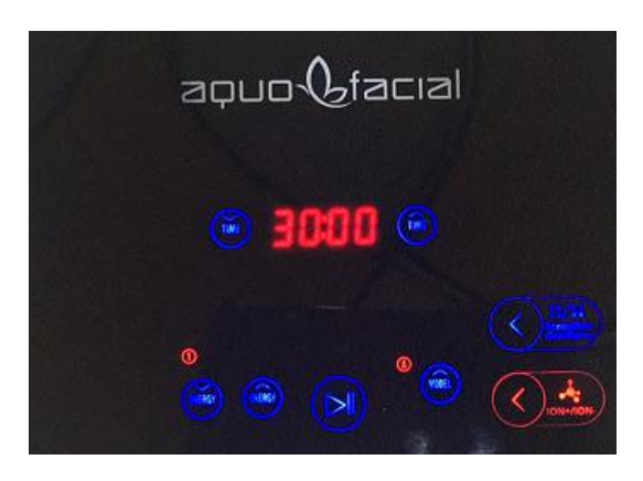
INO+ION- Running State