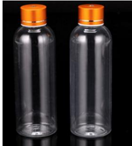
Bottle for clean water/Bottle for dirty water

Adjust the water yield of bubble cleansing. Twist the knob to the left to increase the water yield and twist it to the right to decrease the water yield.