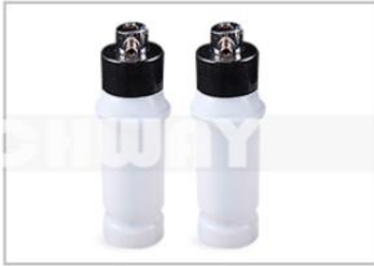
2 x Spray bottle