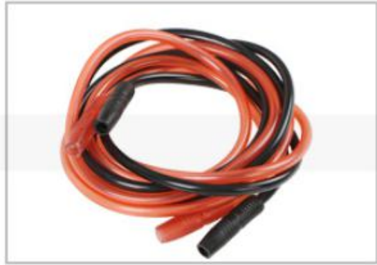
Red and black tuse