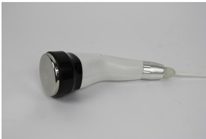
40k cavitation head