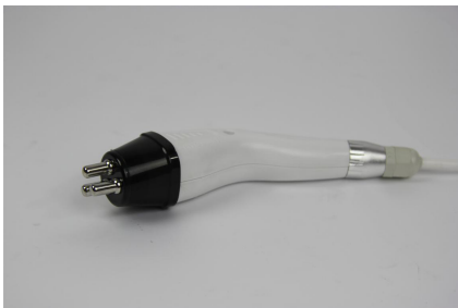
Tripolar RF Head