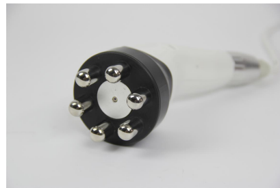
Sixpolar RF + Laser