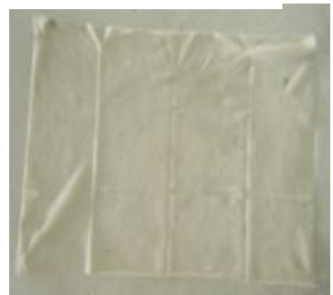
Cryolipolysis suction head