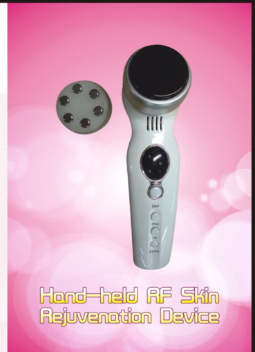
Hand-held RF Skin Rejuvenation Device