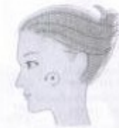
Massage around acne.