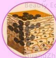
Photothermal laser act on skin dermis.