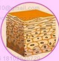
Discharge through metabolism to smooth skin.