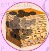
Penetrate deep skin, absorbed by melanin granule.