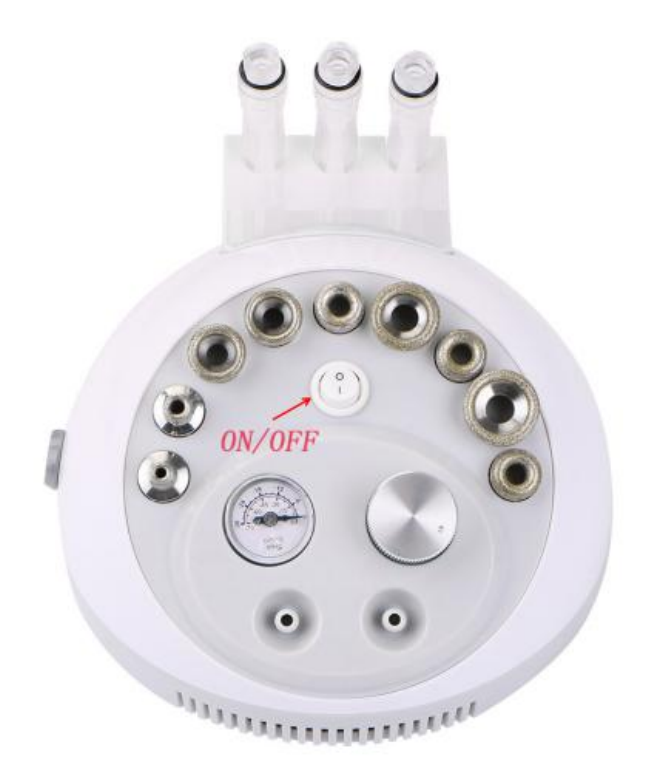
Chapter 3: Operation guide

C. Press the power bottom to start/finish treatment.